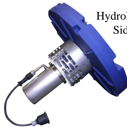
HydroMax Series Side View