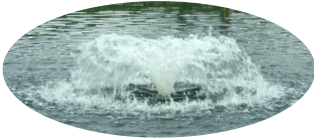
Shasta (Low) 1/2 HP Assembly

Now you can enjoy all of the high volume attributes of The Volcano II Floating Surface Aerator products more dramatically. The HydroMax Series creates a uniform, conical fountain display by adding an assembly within the existing Volcano's float assembly. This will create your desired conical effect, either high or low, with tremendous gpm and subsequent oxygen transfer results. Reach a new level of HydroMaximum Performance for your toughest aquatic conditions, beautifully. Simply specify the Part No. in charts below when ordering your Volcano II Model as required.