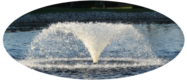
Etna (High) 1.5 HP Assembly